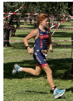
Y7 student racing in a triathlon