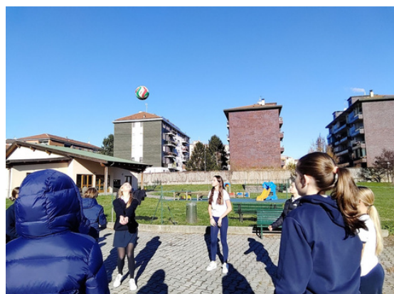
Y9 girls playing volleyball