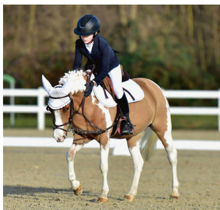
Y7 student in a Dressage competition