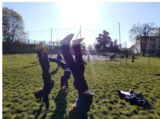
Y7 and Y8 girls doing gymnastics