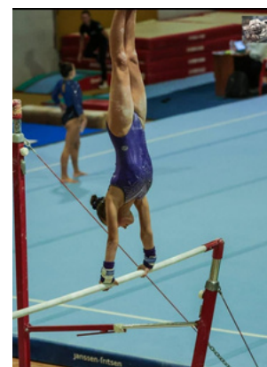
Y7 student practicing on bars