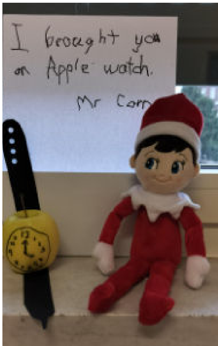
Elf on the Shelf has made it to school.